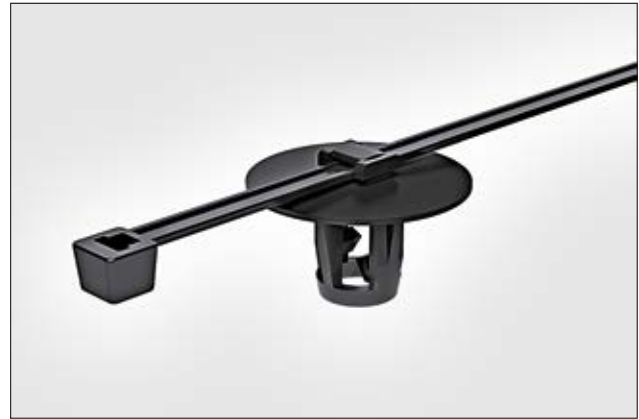
Two Piece Fixing Tie T50RSBH5SD for weld studs.