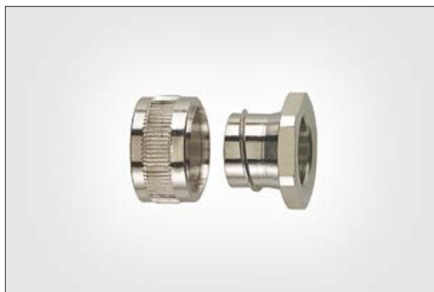
HelaGuard SC-PC Plain Hole Connector.