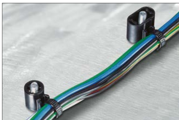
This outside serrated cable tie with weld stud mounting keeps the cables close to the fixing stud.