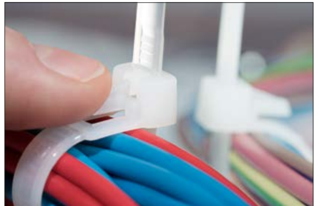
Releasable and reusable cable tie, REL-Series.