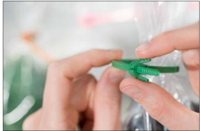
The inside serrated REZ ties have a one-hand, simple release mechanism.