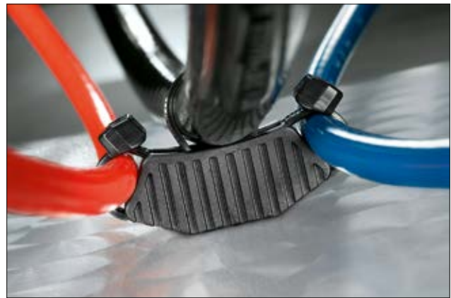
Saddle Mount MSBT120.