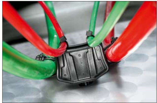
The mount can secure up to four separate bundles, providing parallel spacing between the frame rail and adjacent bundles.