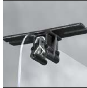
Cables and leads can be fastened with a cable tie or adhesive tape to the bars of the mounting element.