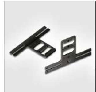
The slim line BC series is particularly compact and flexible.