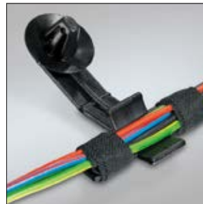
Designed for defined distance of bundles to the hole.