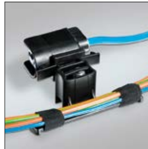
TCSB5CYCC: Tapebar, Stud Retainer and ConnectorClip in just one article.