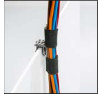
EC17 - Cables and leads can be fastened with adhesive tape to the bar of the mounting element.