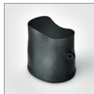
150 Series supplied.