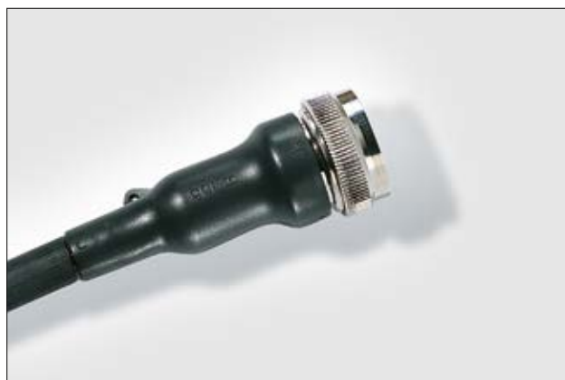
150 Series boot recovered onto a connectors.